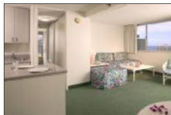
Aqua Island Colony