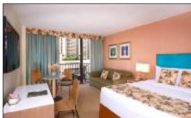
Aqua Palms & Spa

Here are a several participating Aqua hotels: