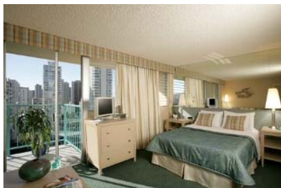
Aqua Aloha Surf & Spa - guest room

*amenities vary – please visit www.aquaresorts.com for current list