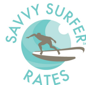
Savvy Surfer SM – logo